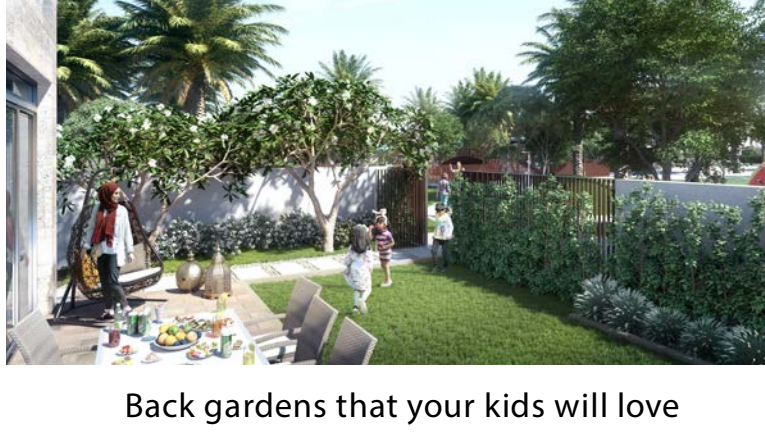
Back gardens that your kids will love