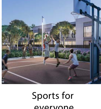
Sports for everyone