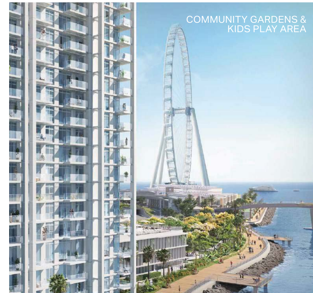
COMMUNITY GARDENS & KIDS PLAY AREA